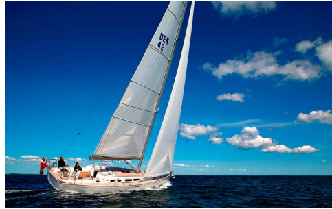
Fig. 3. Crossing the ocean: Technologies of experience (sailboat) versus technologies of expedience (hydrofoil, right).

A new generation of virtual technologies will be pivotal to the long-term adaptation process, but their effectiveness will be highly contingent upon how, and for what purpose, they are implemented. If we gear the habitat technologies towards integrating the crew with their surroundings, the perception of the Space environment will shift from one of alienation grounded in the notion of conflicting interests, to one of affinity based on the recognition of common interests. Integration strategies, as opposed to avoidance strategies, are more conducive to establishing empathetic connections and increasing familiarity through perceptual engagement with the exterior conditions. An integrative approach is derived from, but also cultivates, respect for life and all of Nature, valuing both benefits to the human colonists as well as to the environments they inhabit. One obvious application of VTs would be re-creating familiar places on Earth for which