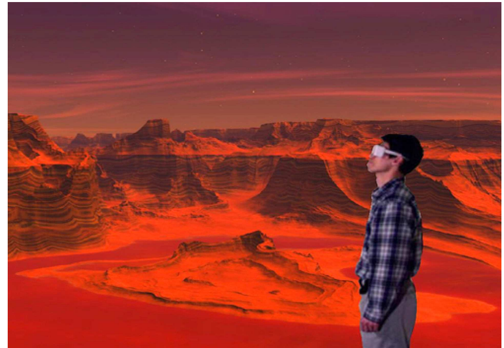
Fig. 4. "Walking" through the Martian landscape.